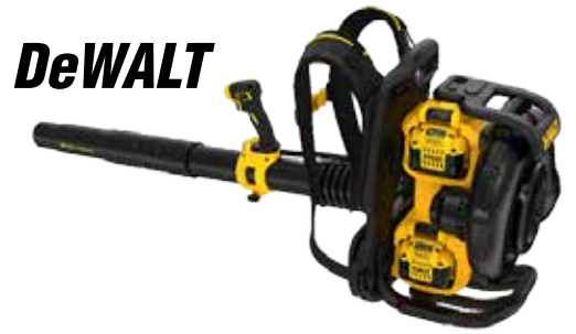
Model : DCBL590X2