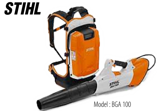
Model : BGA 100

Please note it is the user's responsibility to comply with all local ordinances pertaining to the use of this equipment.