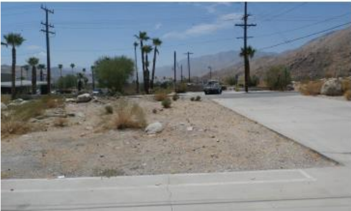
Looking south across subject property