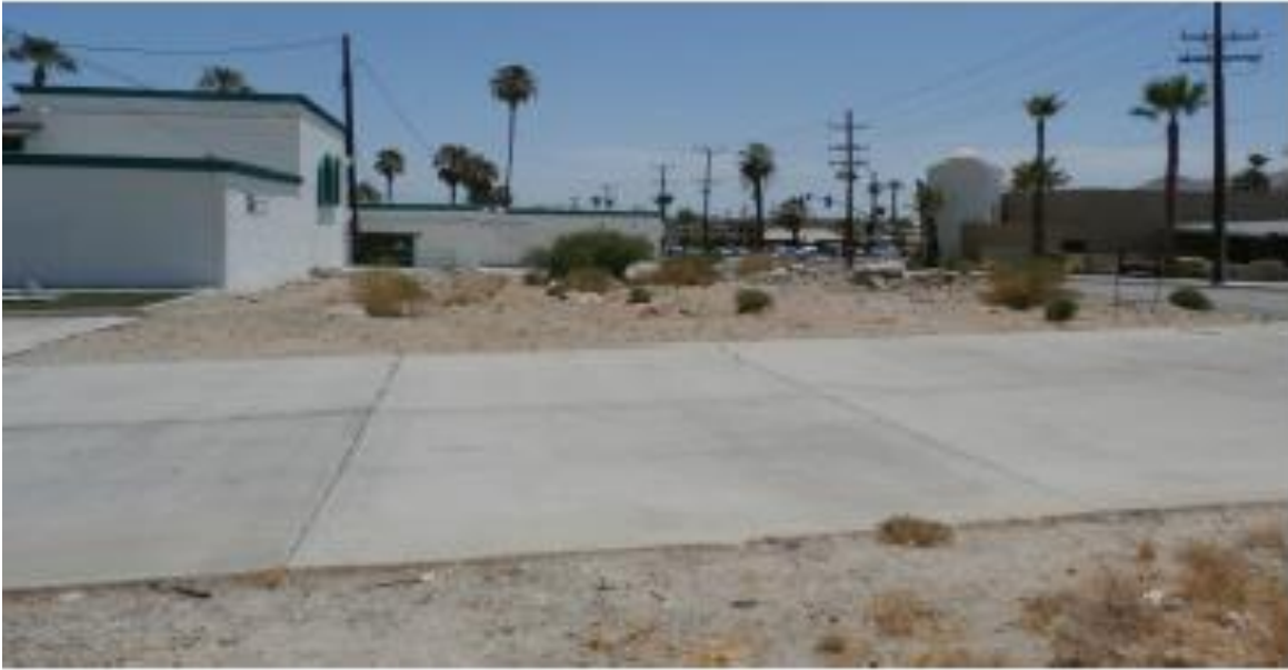
Looking east across subject property