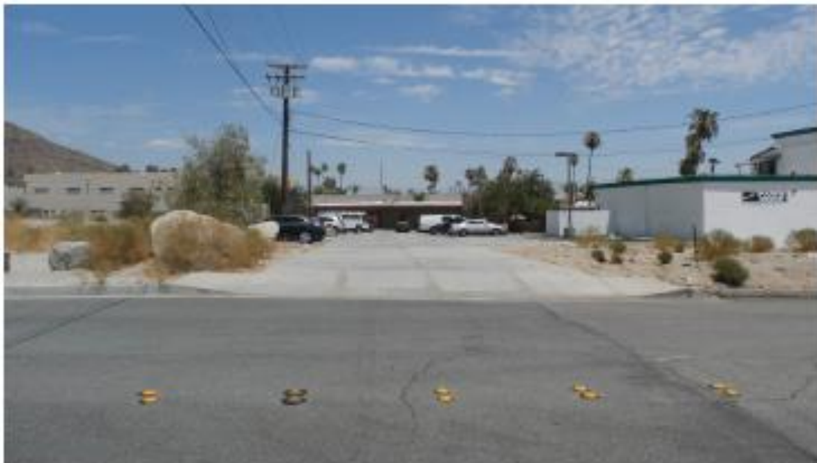
Looking north driveway that runs across subject property