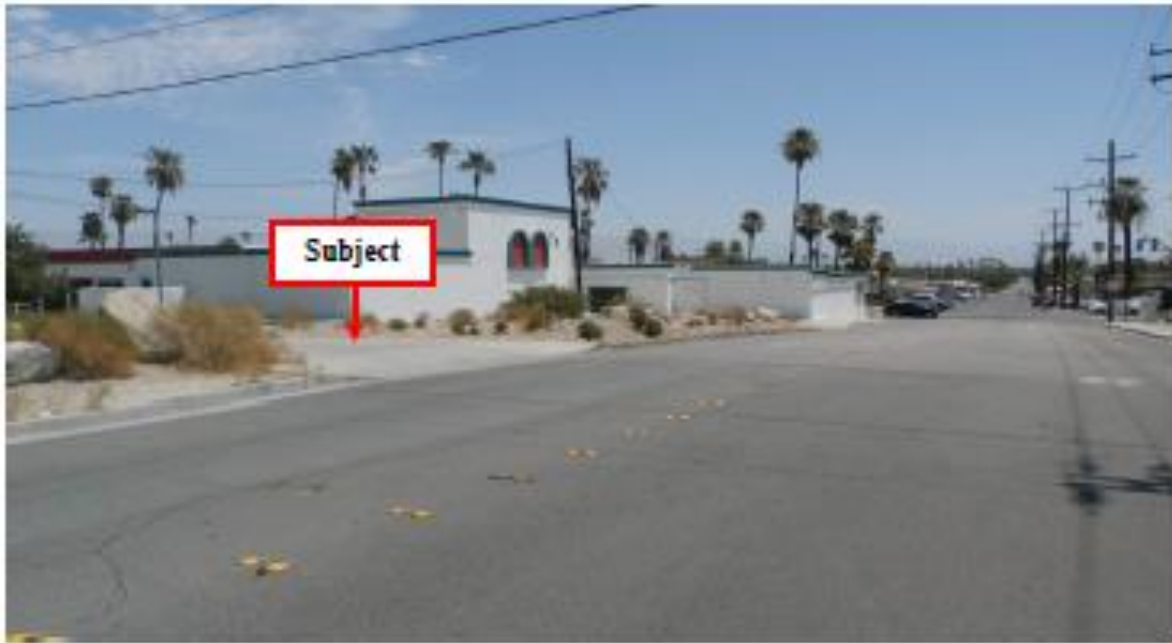
Looking east along Sunny Dunes Road