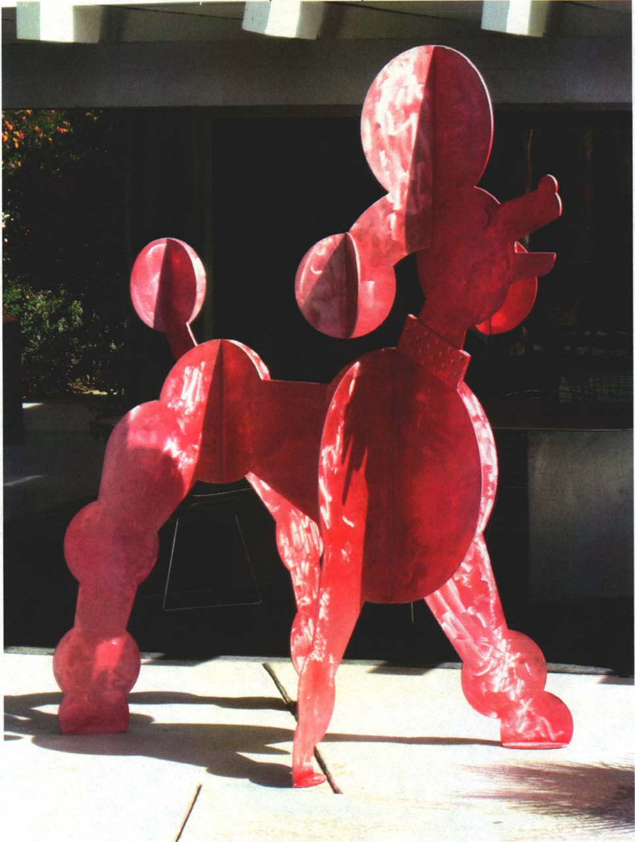
EXHIBIT "A" (ARTWORK)