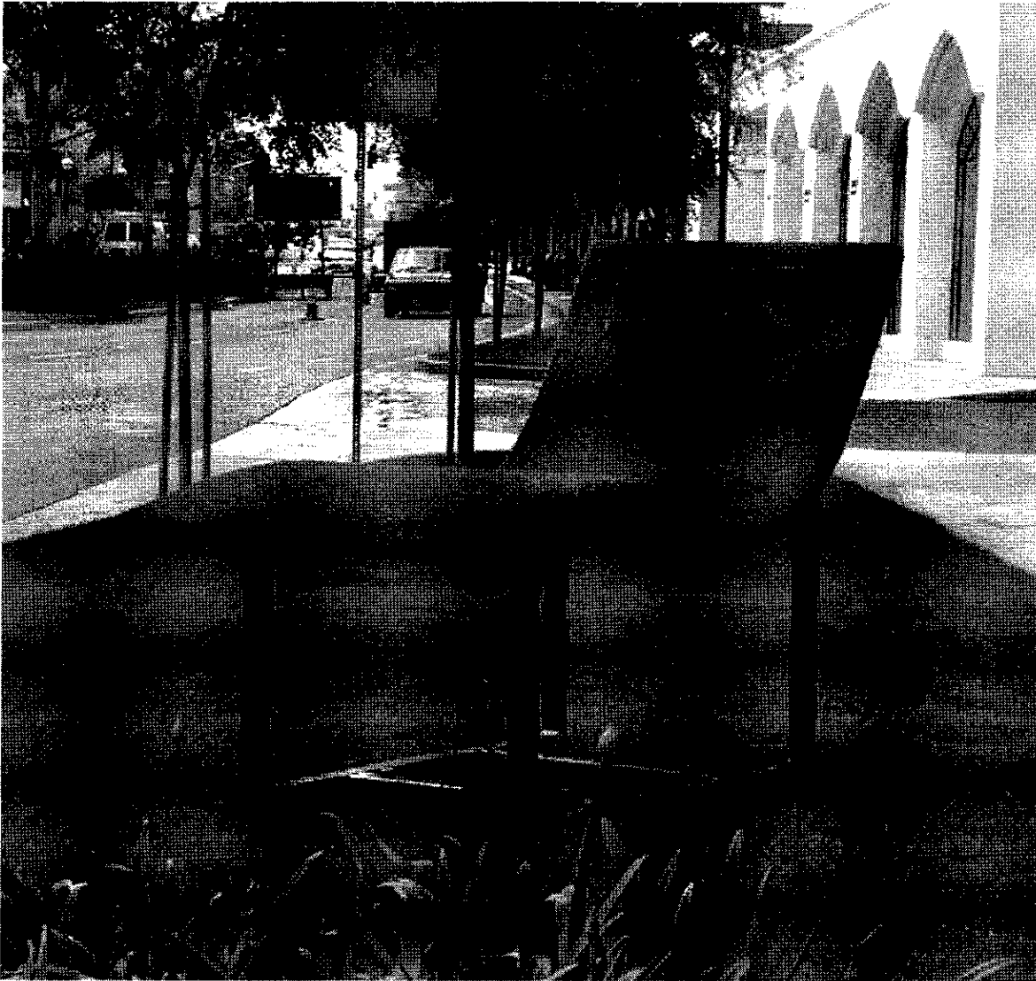
Blue McRight "Impossible Lawn Chair" 7'6" long by 5' high by 42" wide, steel upholstered with artificial grass