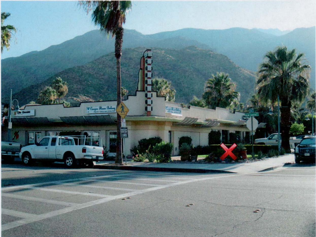
EXHIBIT "B" ART WORK LOCATION 515 NORTH PALM CANYON DRIVE