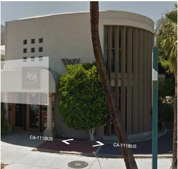
Atakian Building (aka Adagio Gallery Bldg.)