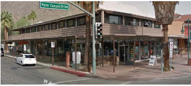
Backstrom Reid Bldg.