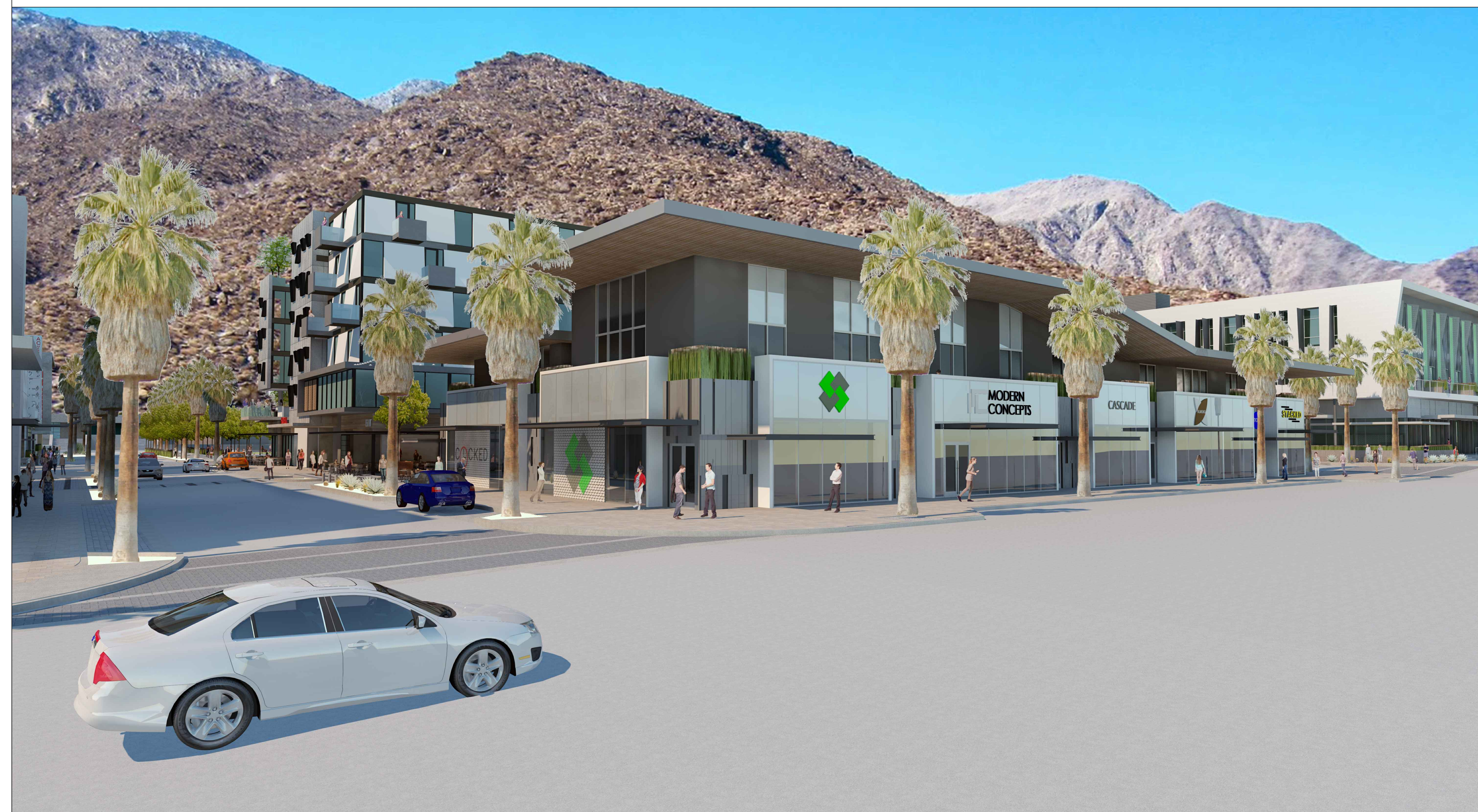
Looking West down Main St. - Block "B" along Palm Canyon w/ The Park Hotel in the Background