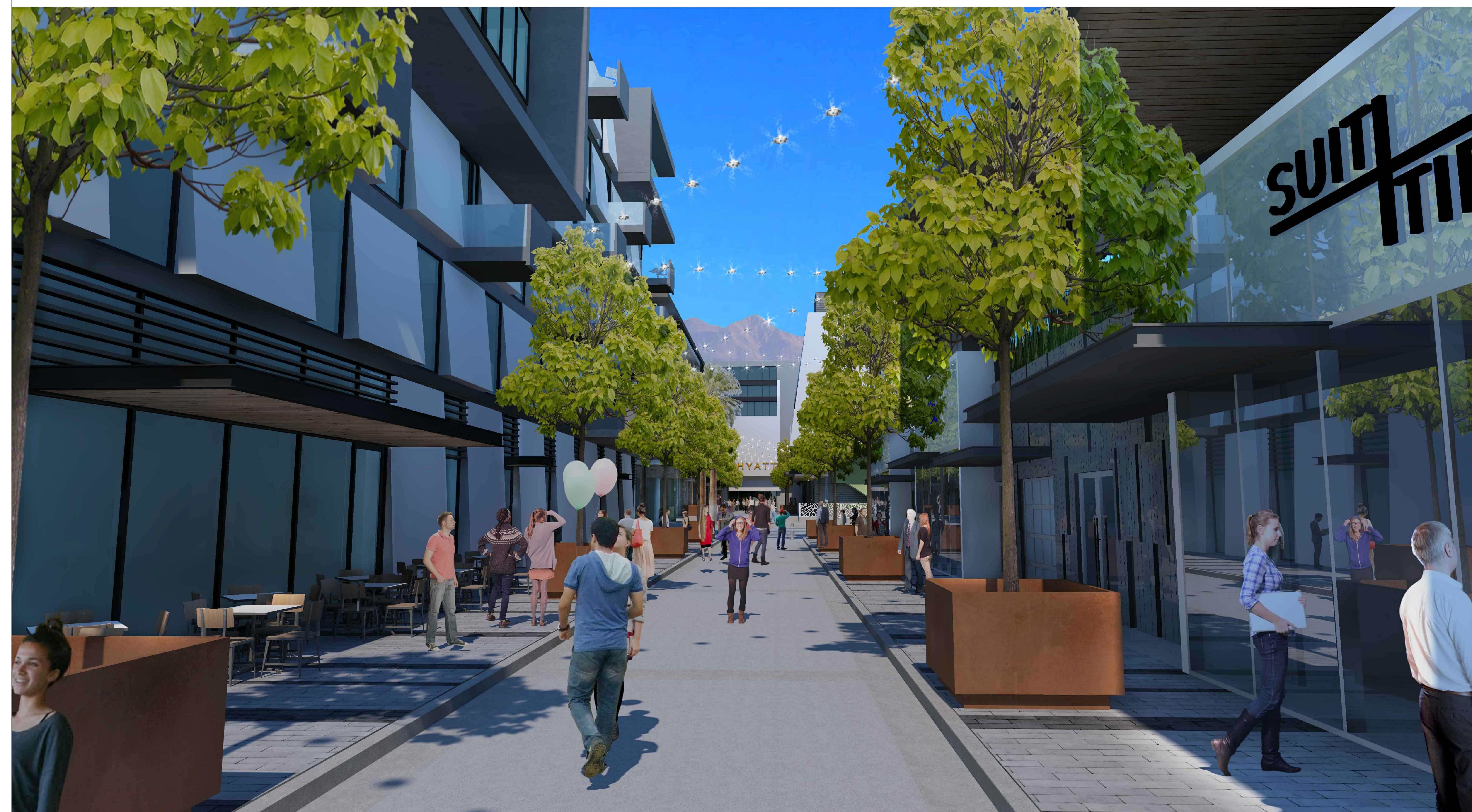
Pedestrian Paseo (Market St.) between Block "B" and The Park Hotel