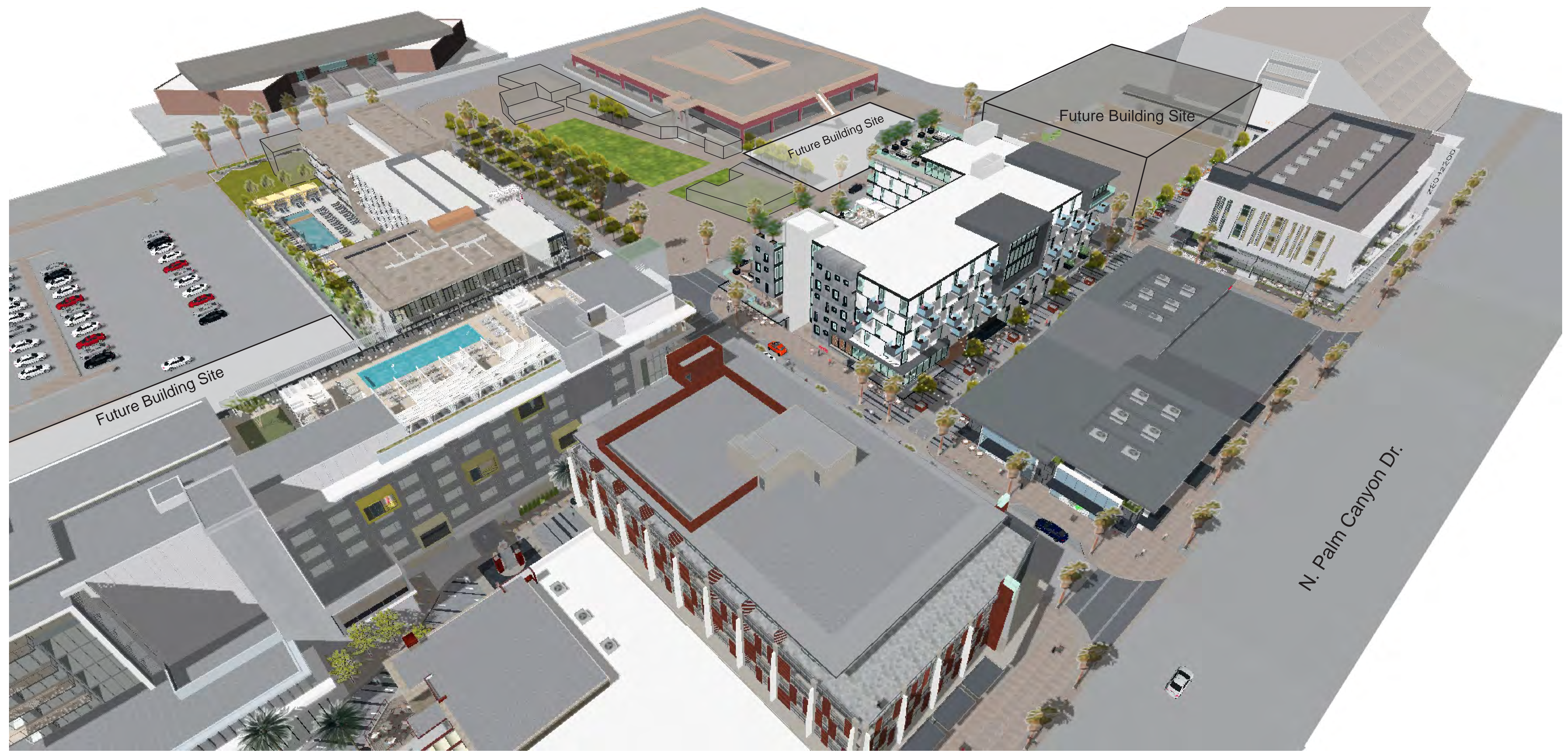
Overall View Looking Northwest