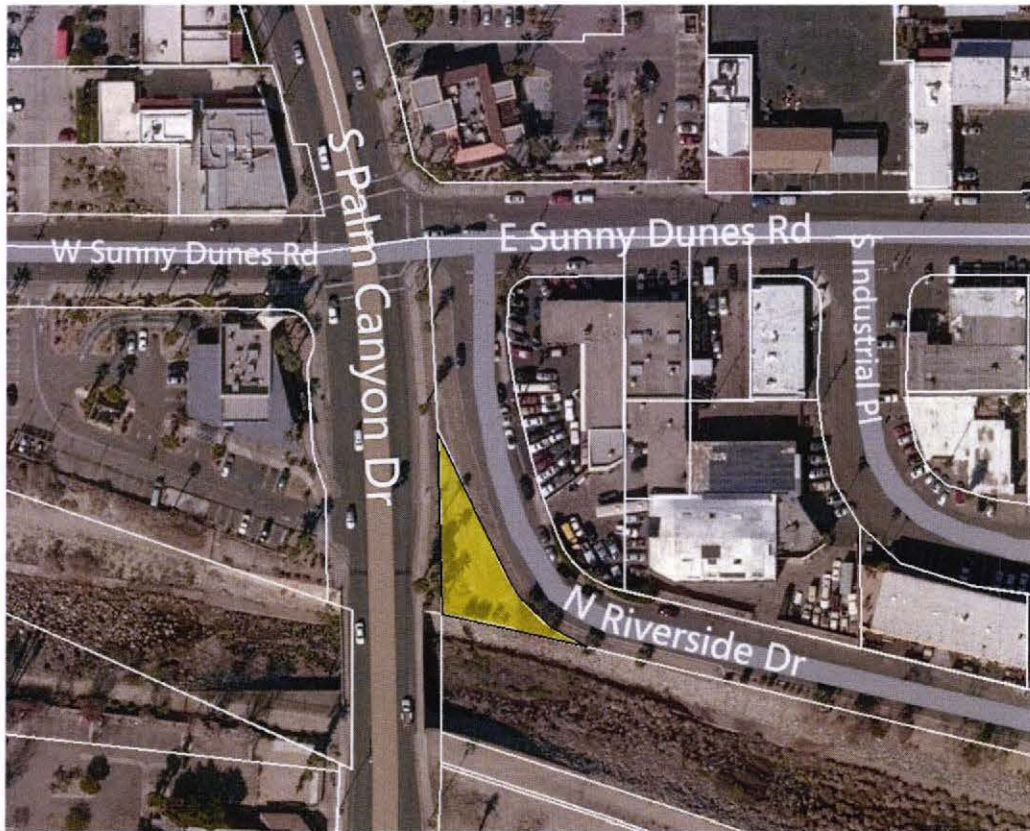
Figure 1 - Location Map

modifications, landscape lighting and electrical systems modifications, traffic signal equipment relocation, signing and striping modifications, and all appurtenant work. An aerial map of the site is identified in Figure 1.