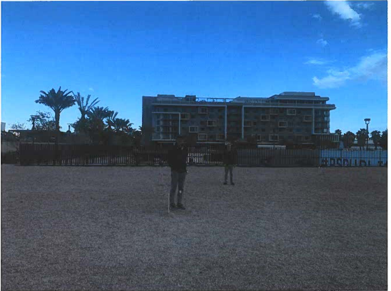
This image shows crew standing in proposed load bearing positions.