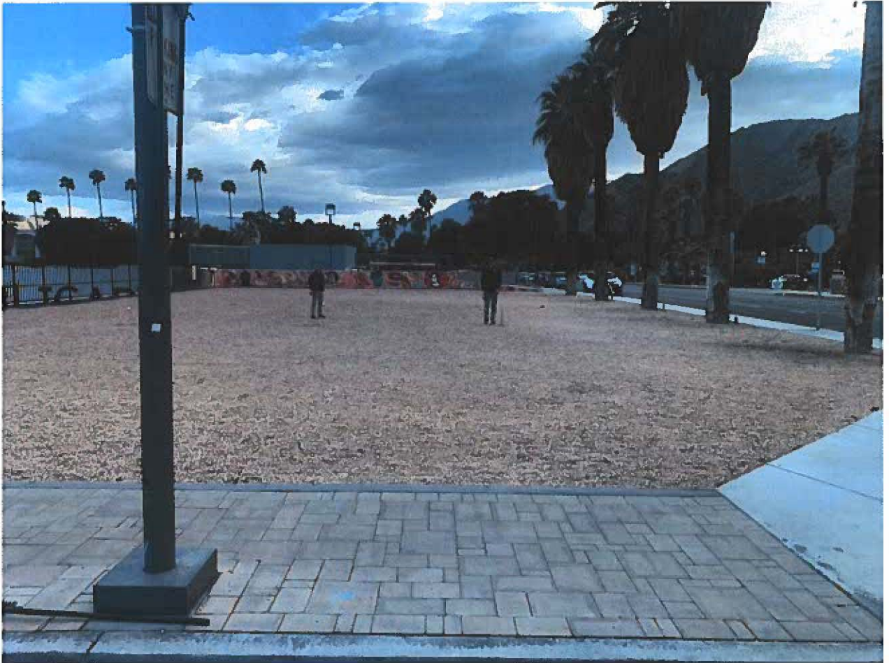
Camera looking South.