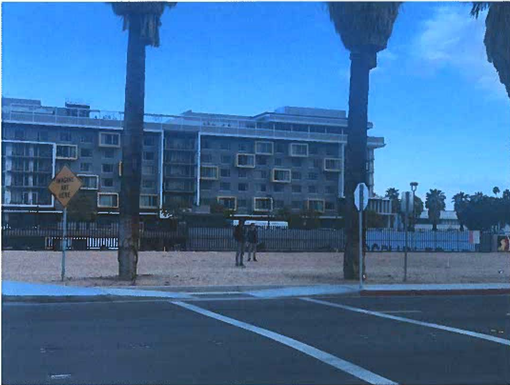
Crew is facing the museum. Camera looking East.