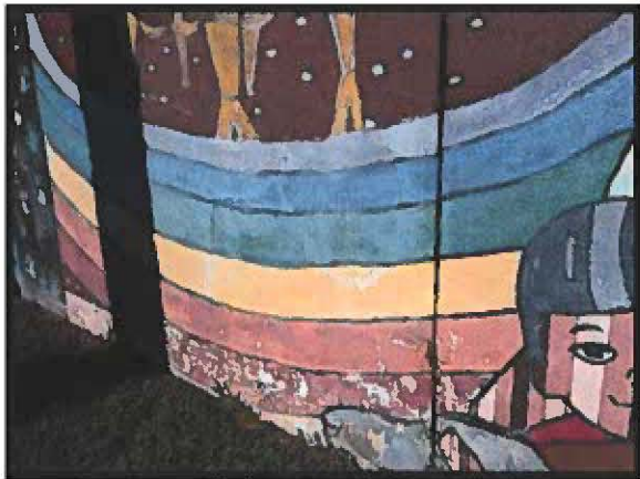
Detail photo of deterioration & severe fading of paint on mural