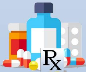
MEDICATIONS & SUPPLEMENTS