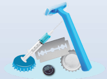
METALS & PLASTICS