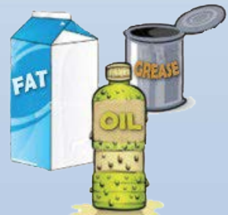
FATS, OILS & GREASE