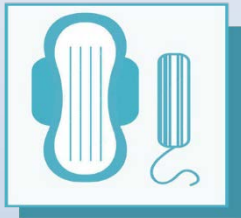
FEMININE HYGIENE PRODUCTS