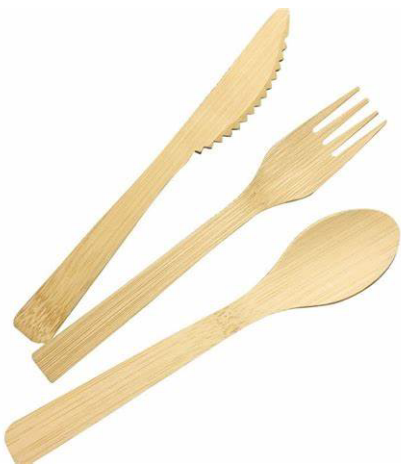
Fork, spoon, knife, spork