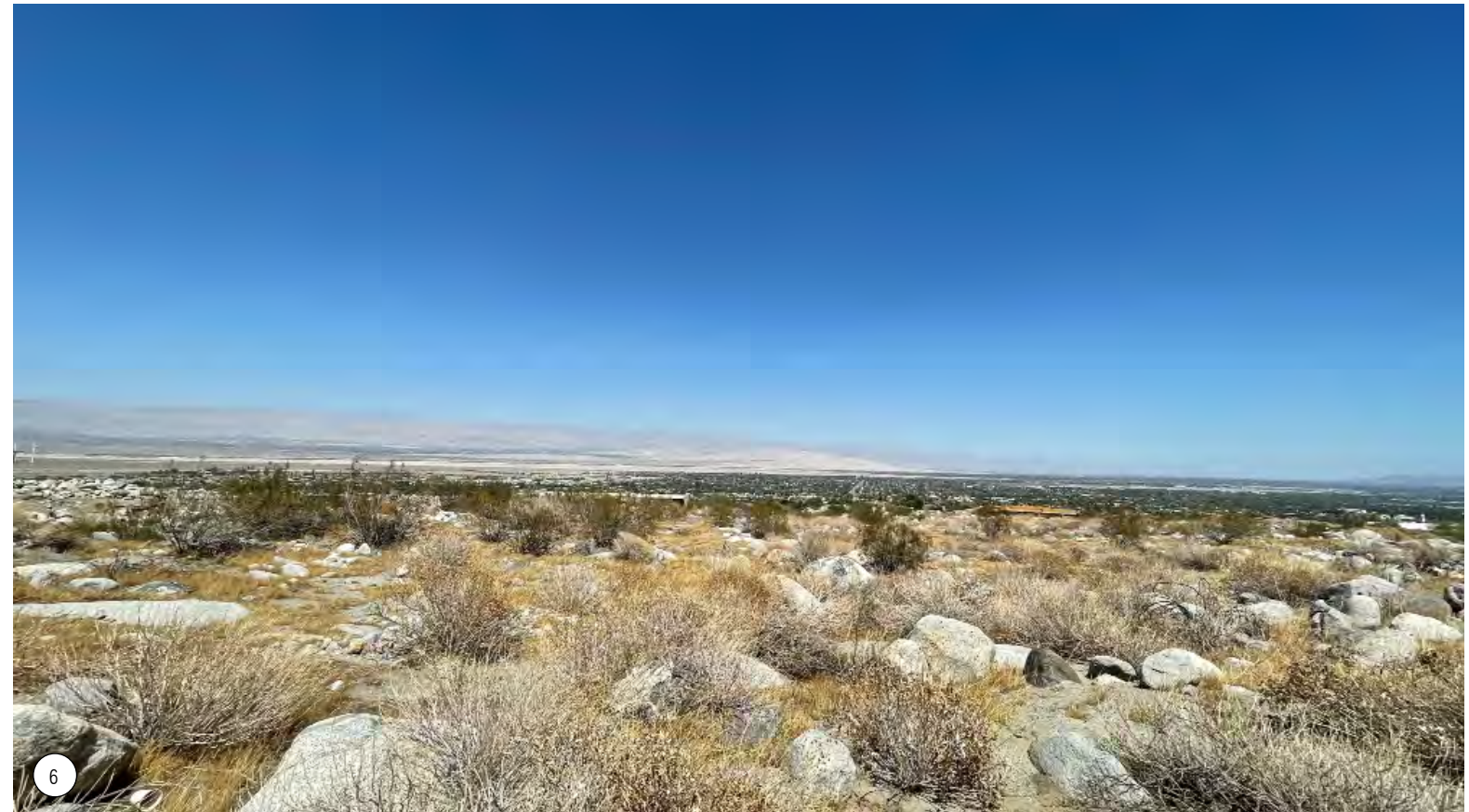
6. NORTHEAST VIEW AT WEST EDGE OF DP 10