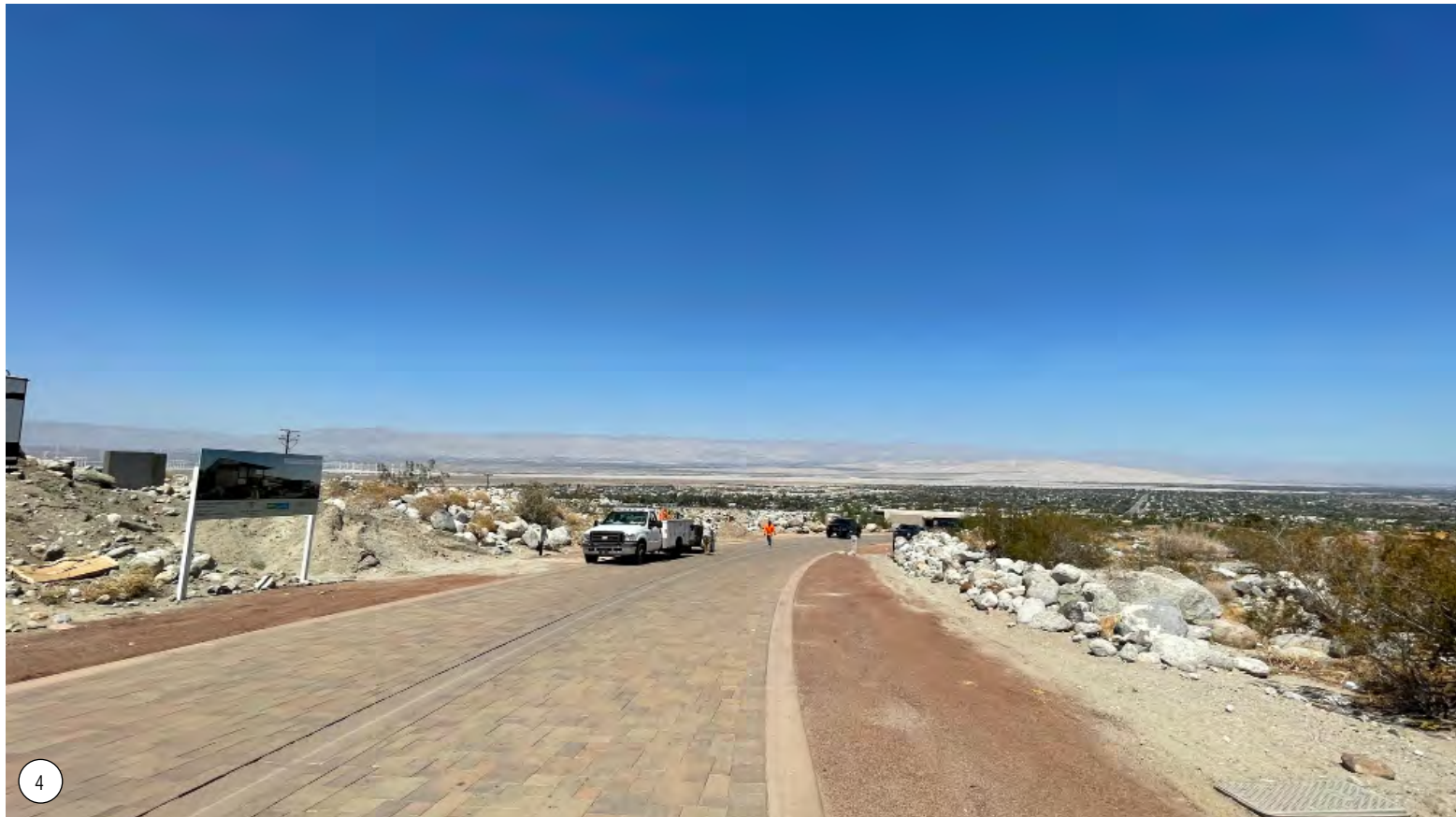
4. NORTHEAST VIEW OF STREET AT NORTHWEST CORNER OF DP 10