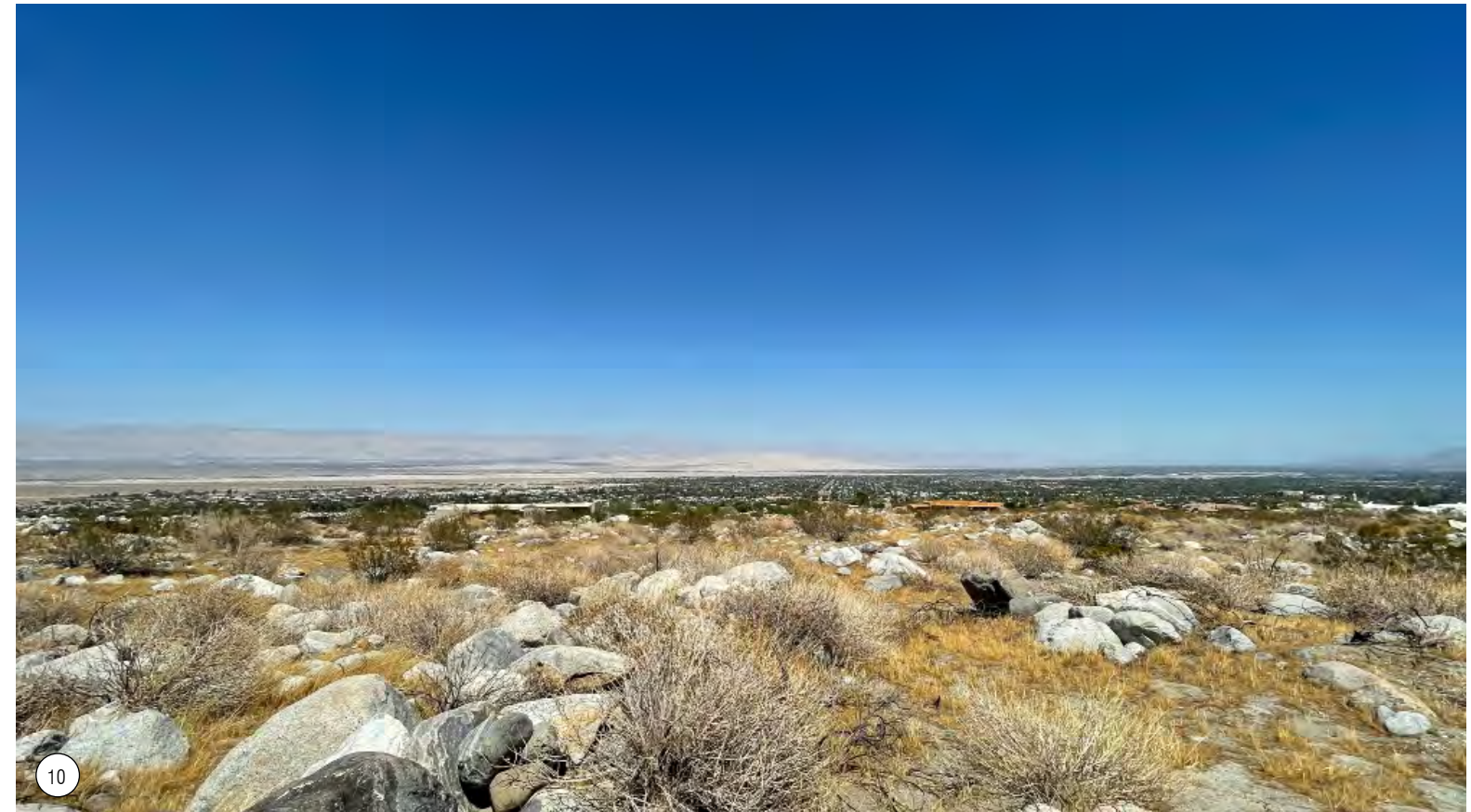
10. NORTHEAST VIEW AT SOUTHWEST CORNER OF DP 10