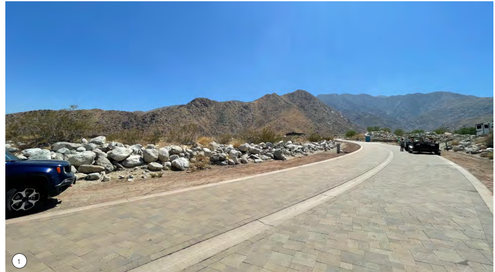
1. SOUTH VIEW LOOKING AT LOT 10 FROM STREET