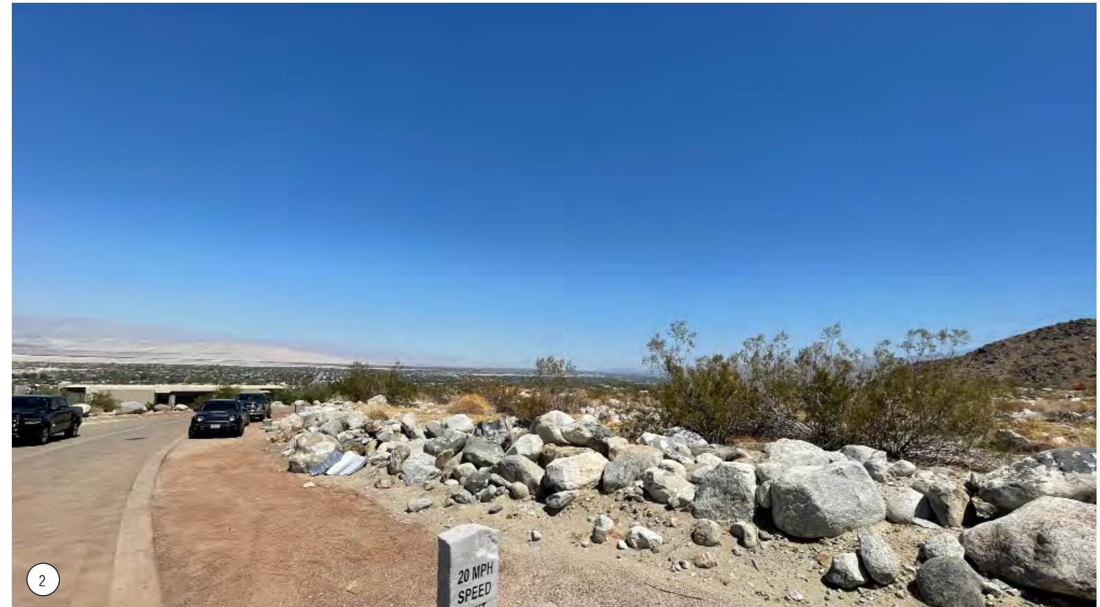
2. SOUTHEAST VIEW LOOKING AT LOT 10 FROM STREET