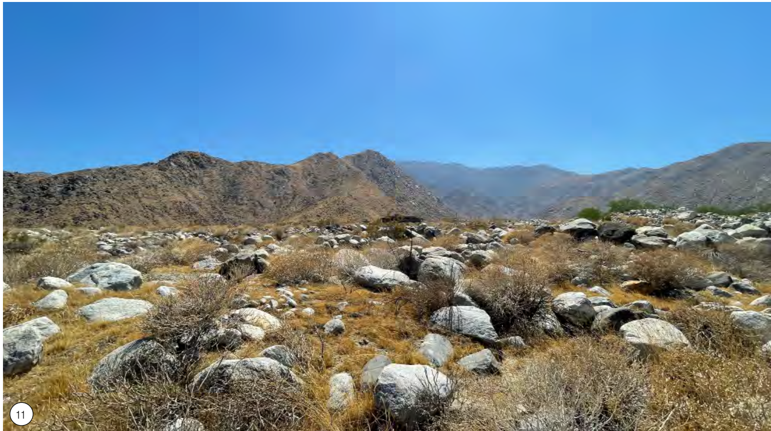
11. WEST VIEW AT SOUTHWEST CORNER OF DP 10