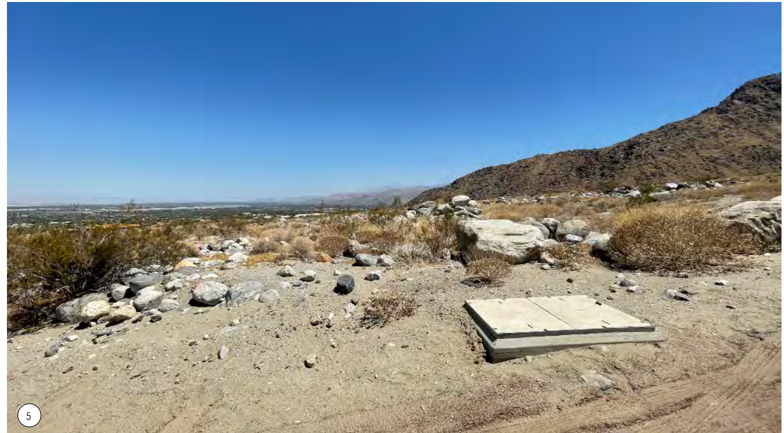
5. SOUTHEAST VIEW OF LOT 10 FROM NORTHWEST CORNER OF LOT 10