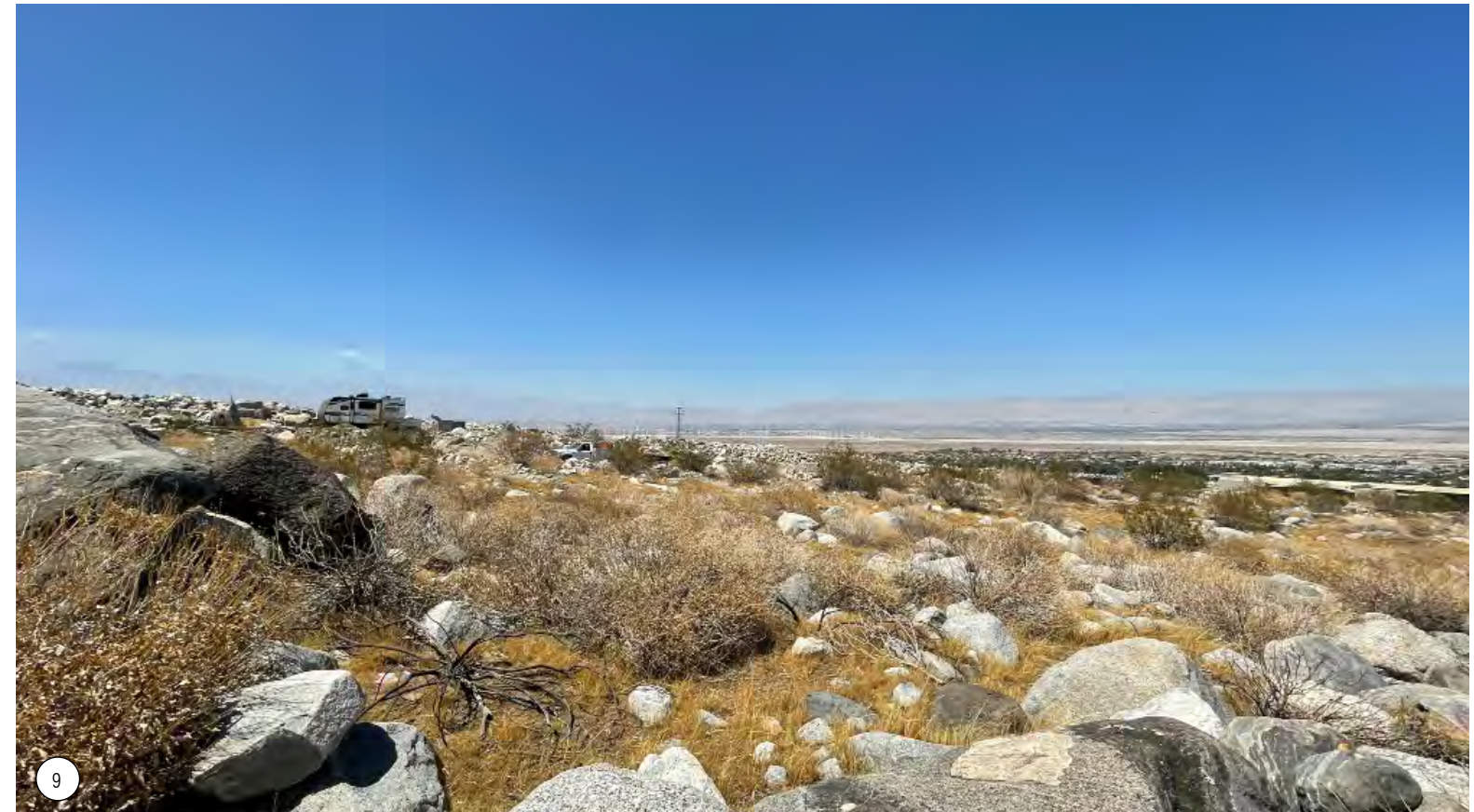
9. NORTH VIEW AT SOUTHWEST CORNER OF DP 10