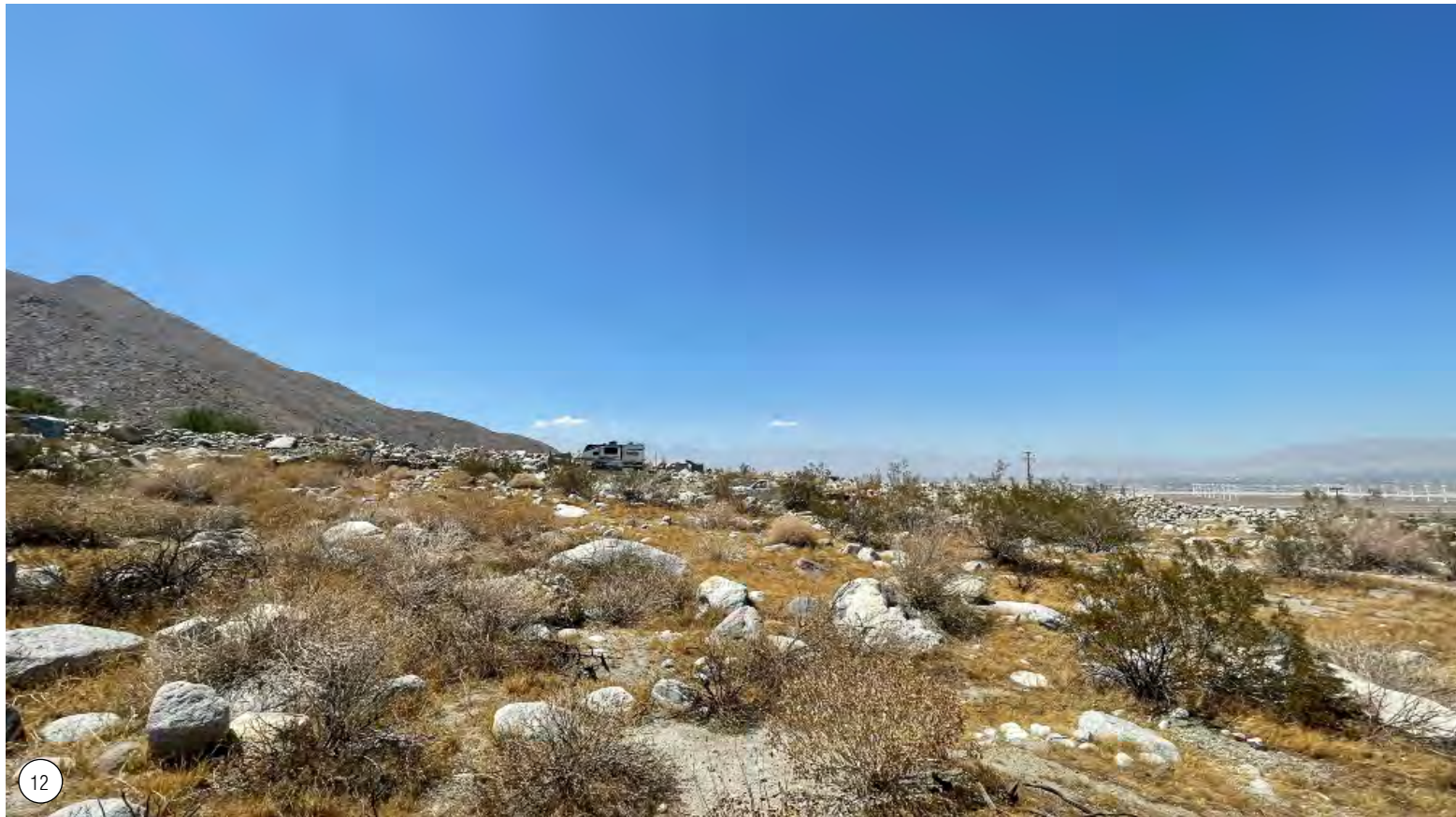
12. NORTHWEST VIEW AT SOUTHWEST CORNER OF DP 10