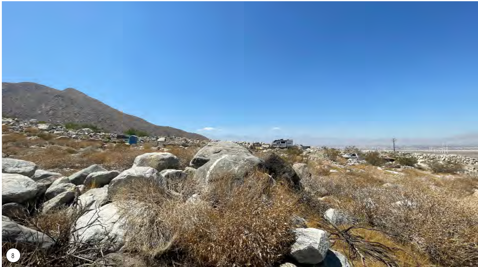
8. NORTHWEST VIEW AT SOUTHWEST CORNER OF DP 10