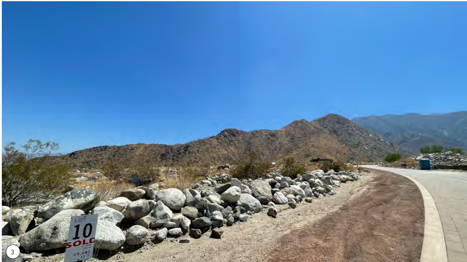
3. SOUTHWEST VIEW LOOKING AT LOT 10 FROM STREET