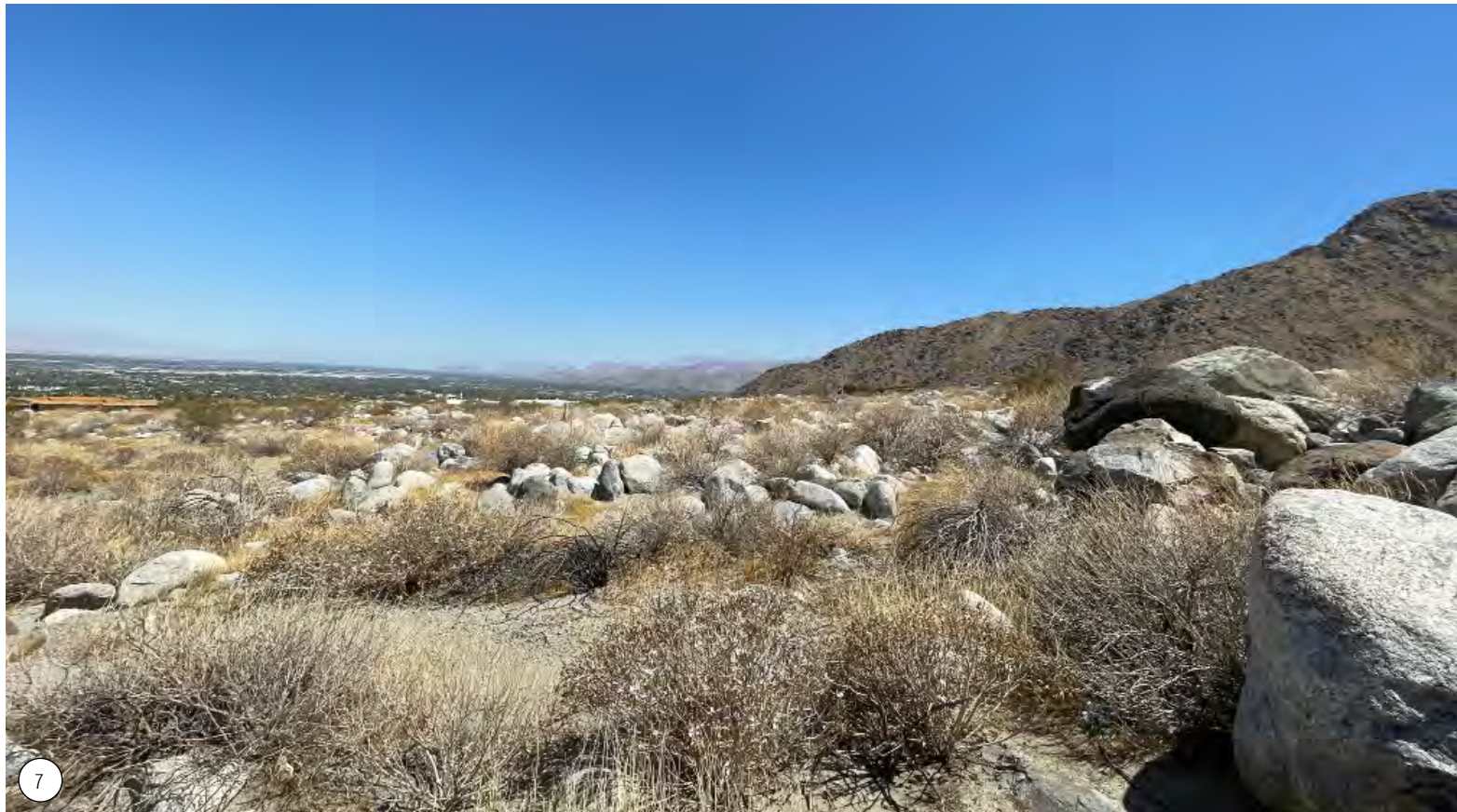
7. SOUTHEAST VIEW AT WEST EDGE OF DP 10